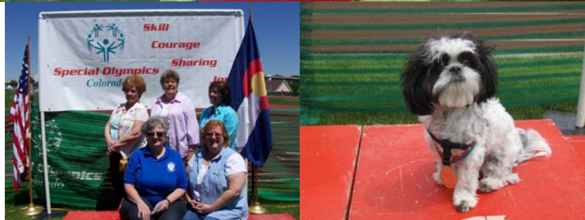
Don't You Think I Deserve a Medal? Our Mascot Mr. Paco